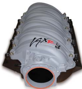
LSX R ™ CAD Image